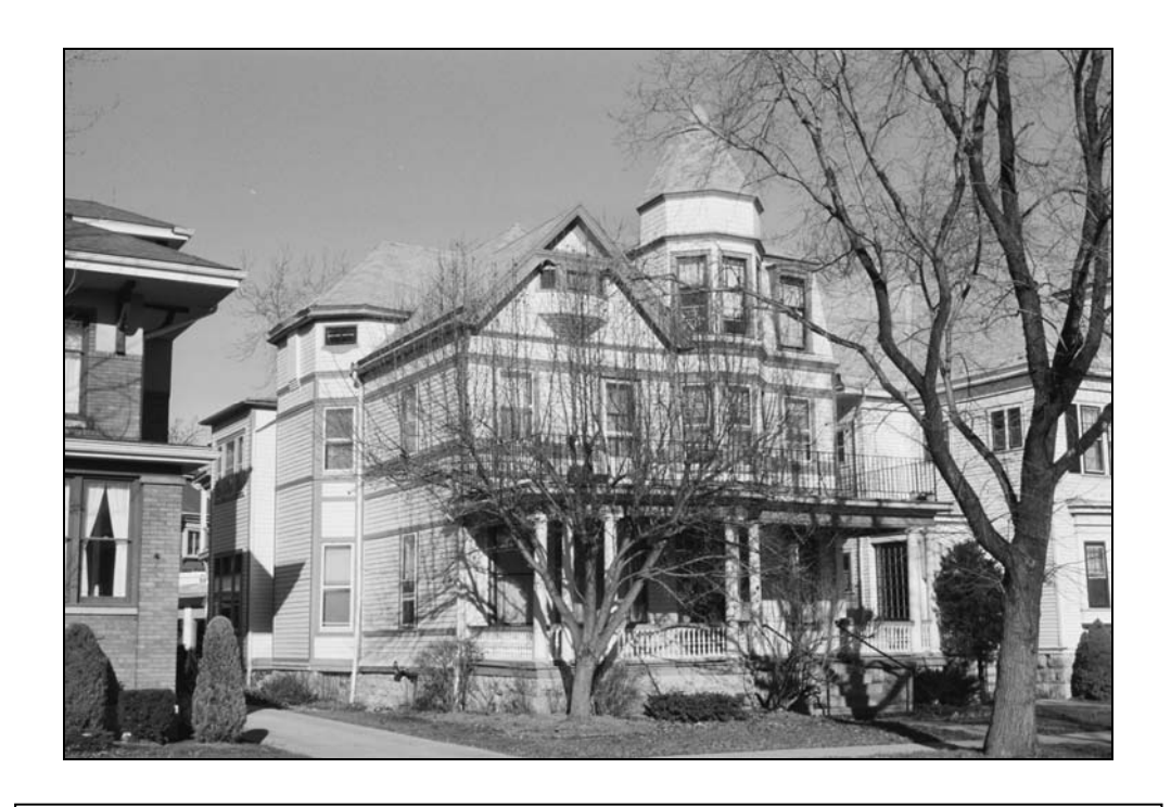
Figure 3-11. 40 Bidwell Parkway (1885)