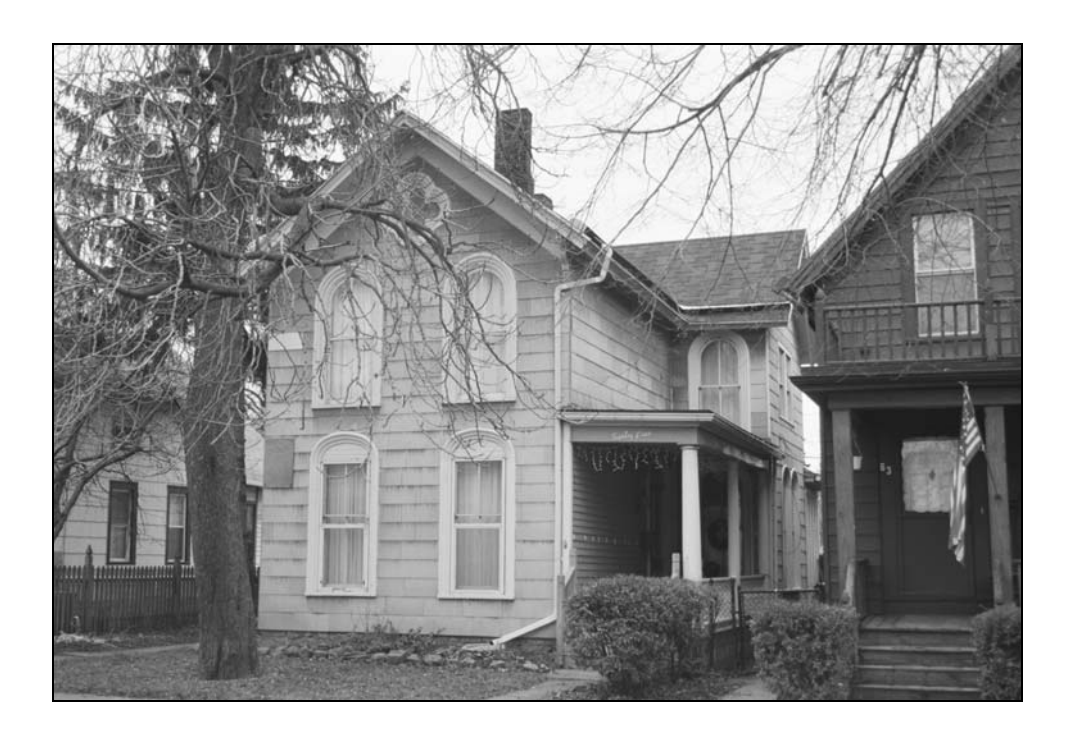
Figure 3-9. 65 Potomac Avenue (ca. 1874)

From the 1890s to the 1920s, Grant Street grew into the chief commercial street in the western part of the survey area. Ground floor shops with apartments above—so-called "mom and pop" stores—set the pattern for early commercial development along Grant Street. 212 Grant (ca. 1895), 83 Grant (ca. 1896), 91 Grant (designed in 1922 by Louis Greenstein with shop front modernization in 1951), 242 Grant (1914), and 285 Grant (1923) are all in use today for their same purpose that gave them life decades ago. Together with Elmwood Avenue on the eastern side of the survey area, Grant Street continues to be one of the liveliest neighborhood commercial streets left in Buffalo.